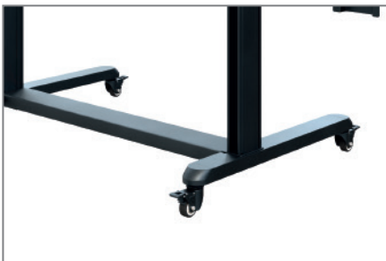
mobile thanks to castors with lock-type brake

In addition to the pre-configured systems, HAGOR offers customised special solutions in the LED sector, which can be individualised with accessories such as loudspeakers, controls and so on to meet all requirements.