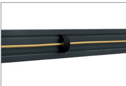
Cable routing with clips